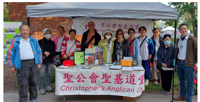
烈治文山第三區燒烤日 Richmond Hill Ward 3 BBQ (2023/06/07)

May I invite you to join our Carol Gospel service on December 10 and Christmas Day service. On behalf of the church, I wish you a blessed Advent and a very Merry Christmas!