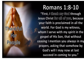
成人主日學《羅馬書》 Adult Sunday School (2023/01/08)