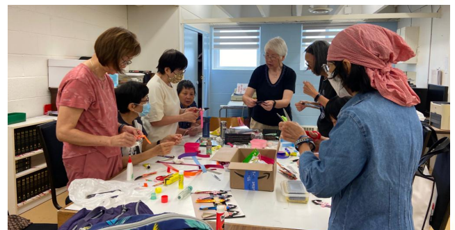
「活力星期五」手工班 Friday YEAH Craft Class

其中，「乒乓球班」是活力社中十分受歡迎的活動。在此，感謝義務導師們細心地教導長者打乒乓球。他們不但注意活動期間的安全，還用注重於長者球技上的進步。我們鼓勵參與的朋友互相免勵，在沒有壓力下學習新的技能，不論輸贏，最重要大家感受在基督大家庭內的喜樂。