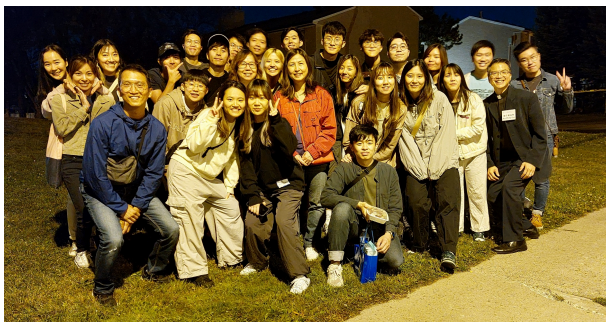
On Your Mark 團契 - 為新移加青年辦的中秋晚會 Mid-Autumn Festival Celebration with HK Newcomers (2023/09/29)

There was a steady influx of new immigrants arriving from Hong Kong to the Greater Toronto Area throughout the year. St. Christopher's were grateful for many of our parishioners, who continued to love and care for them. They brought with them new energy and youthful dynamics to the church. We are currently seeking a full-time pastor for our outreach programs, which include reaching out to HK newcomers.