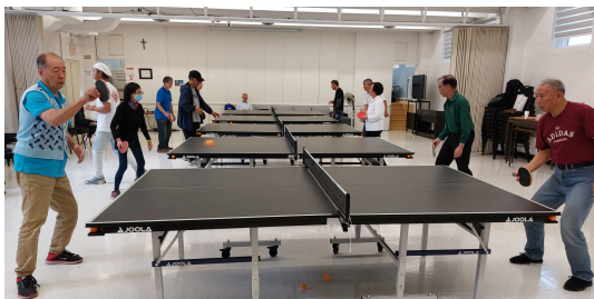
為教區信心工作籌募的乒乓球接力 Ping Pong Relay for Diocesan FaithWorks (2023/10/14)