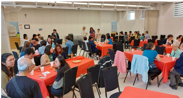
迎新會聚餐 Welcoming Party (2023/06/04)

最後，我在此想邀請你來參加我們 12 月 10 日的聖誕歌述福音崇拜及 12 月 25 日的聖誕日崇拜。僅代表教會，祝大家有個蒙福的將臨期及聖誕快樂！