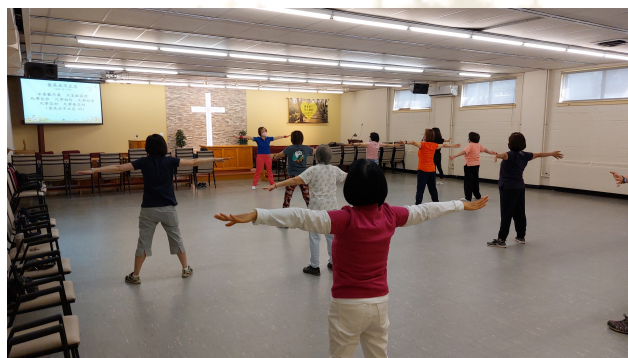
「活力社」讚美操 Praise Dance (2023/05/13)

「活力星期五」每個星期五上午十時至十二時在烈治文堂舉行，歡迎大家參加！同時也歡迎「年輕」的長者和不用上班的人士來幫忙。每一項活動都有「中場點滴」時段，以簡短的福音信息和禱告，使參加的人都得到靈命的滋養，互相扶持，愉快地同行人生的路。