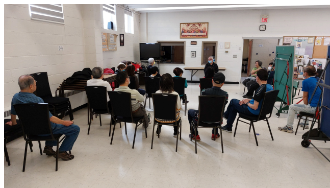
「活力星期四」中場點滴 YEAH Club devotional time (2023/03/30)